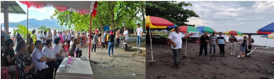
Figure 2. Enhancement of attractions and creative economy activities

The program transitioned from conceptual briefings to practical demonstrations of coastal revitalization. The team provided direct examples of attraction enhancement, marketing techniques, and hospitality services. Members practiced these skills through role-playing and direct interaction with visitors to build technical confidence.