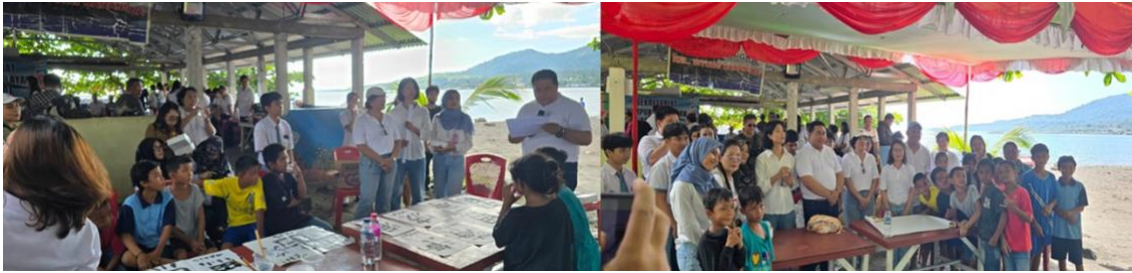
Figure 1. Socialization and coastal tourism potential briefing

Referring to andragogical concepts, the program aimed to internalize coastal management values through strong institutional partnerships (Herlina et al., 2025). The team emphasized that opening the community to external strategic partners is a vital step in diversifying coastal attractions. Furthermore, the team cultivated a critical consciousness regarding creative tourism management, preparing the fishermen to face the challenges of modern tourism. In the era of personalized digital marketing, community-based destinations must provide unique sensations and memorable experiences to remain competitive (Gato et al., 2022; Janjua et al., 2023; Kozak & Correia, 2025).